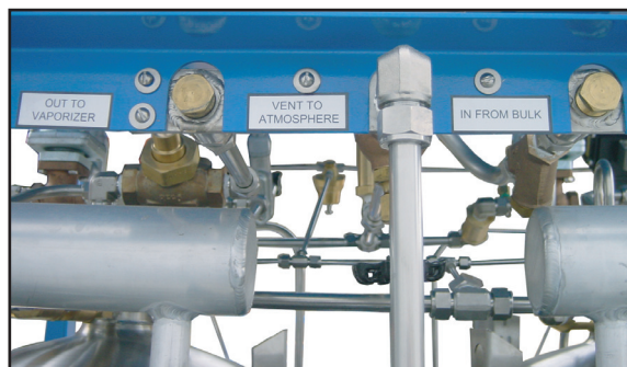
Two Main Connections Simplify Installation