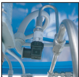
Integrated Bulk Tank Pressure Sensor