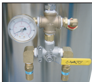
Dual Relief Valve Assembly