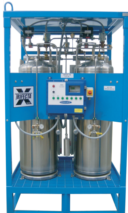
Models X5, X10, X15

The Trifecta® X-Series is the preferred solution for reliable and continuous laser assist gases for delivery pressures up to 450 psi and flow rates up to 15,000 scfh. Drawing liquid from a standard bulk tank, the Trifecta system boosts the liquid pressure by alternately feeding two liquid cylinders equipped with innovative multi-function pressure building vaporizers. The Trifecta solution has no down-time and minimal losses when compared with other laser assist gas solutions. This convenient solution eliminates high-pressure pumps, compressors, cylinder cradles and surge tanks.