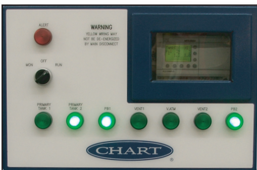
Visual Indication for Operation Modes